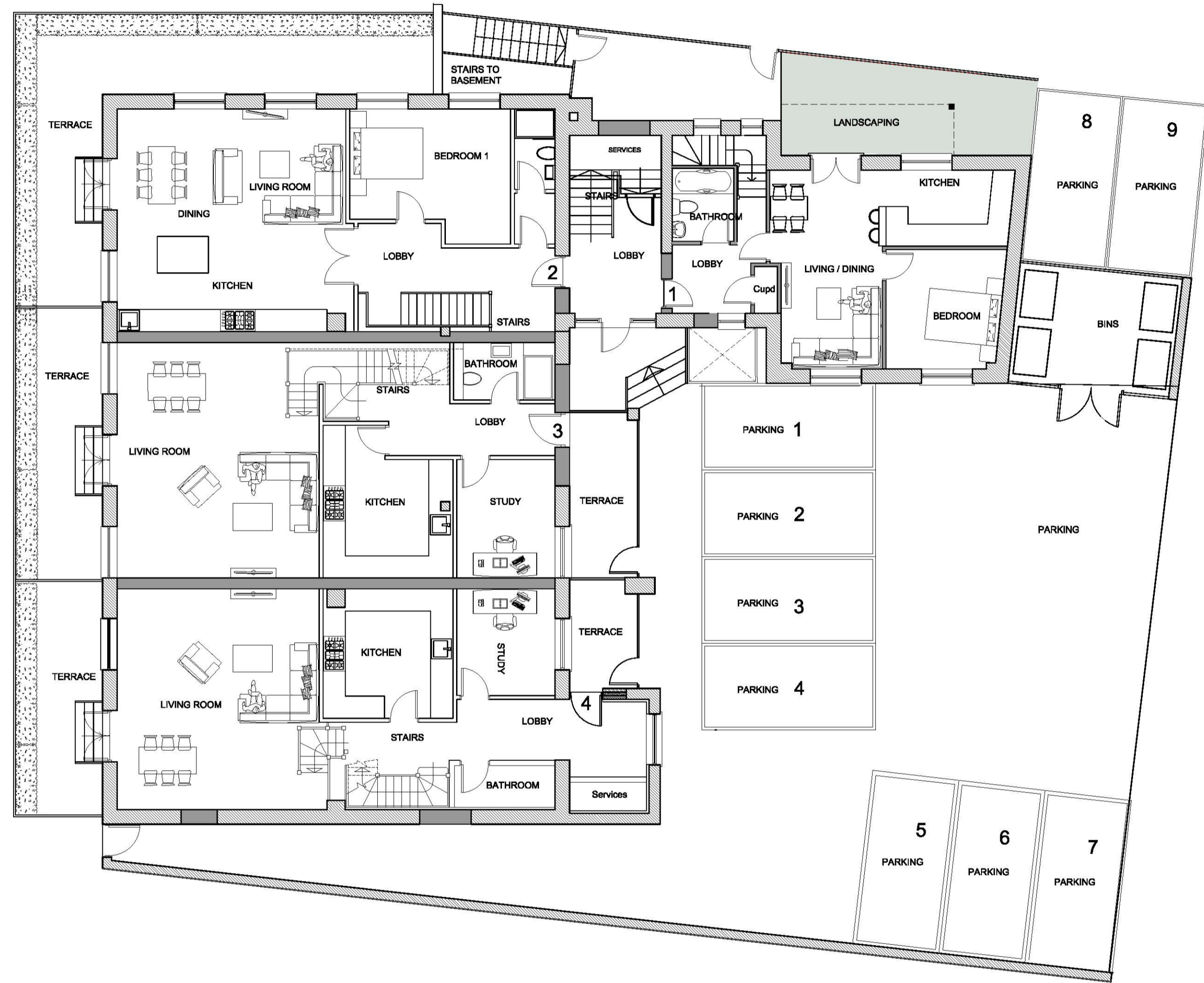
EXISTING GROUND FLOOR SCALE 1:100